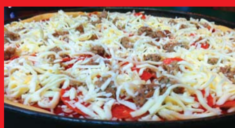
Ready to Bake - Chicago