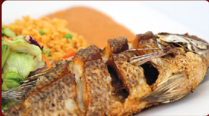
FRIED FISH 12.95