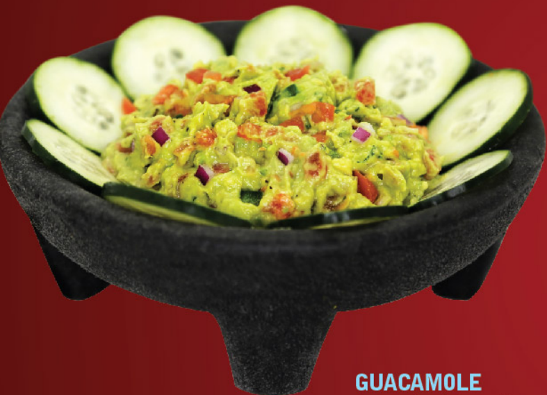
GUACAMOLE Avocado, jalapeño pepper, onion, tomato and cilantro. 8.95

STEP 3 CHOOSE A SAUCE • MILD 🌶️ • MEDIUM 🌶️🌶️ • HOT 🌶️🌶️🌶️