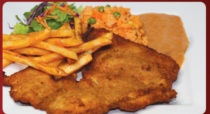
BREADED CHICKEN 13.95