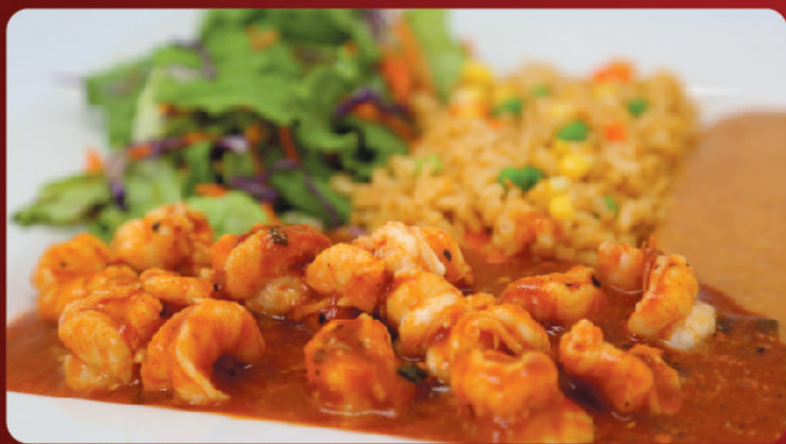
DEVIL SHRIMP 16.95