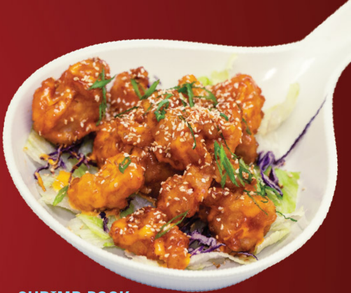
SHRIMP ROCK 14.95