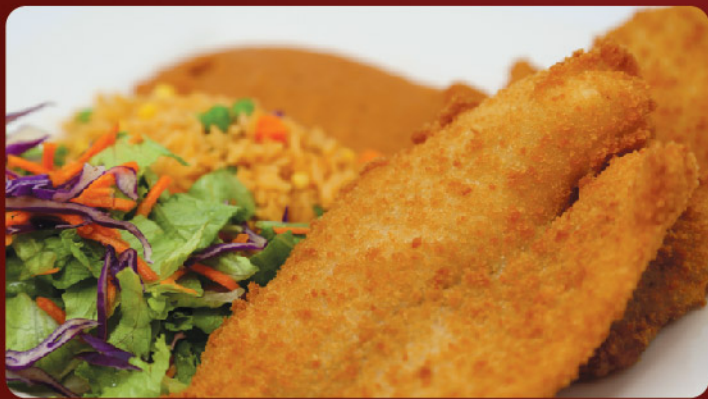
BREADED FISH FILLET 13.95