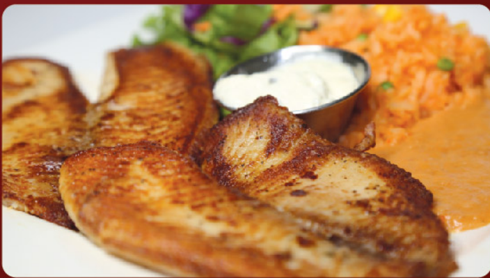
ZARANDEADO FISH FILLET 13.95