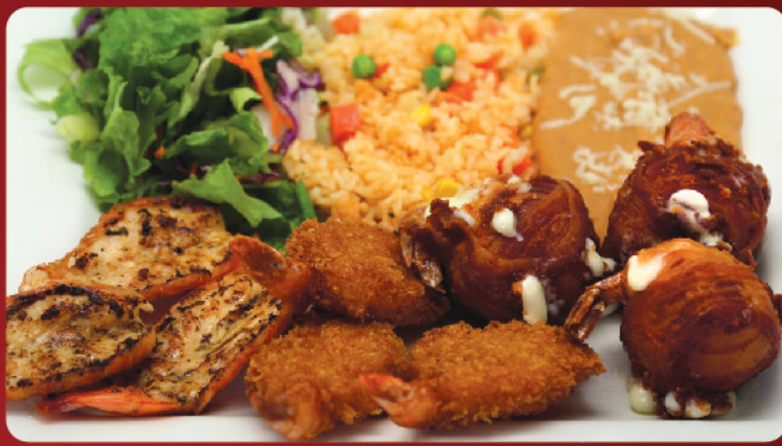
SHRIMP MIX 19.95