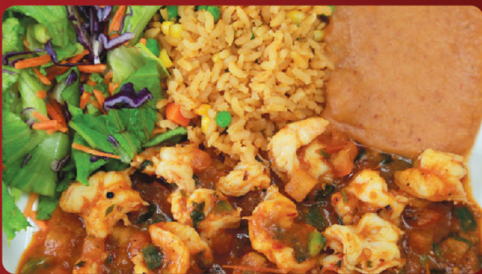
RANCHEROS SHRIMP 16.95