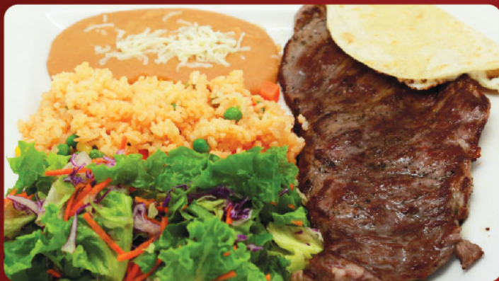
GRILLED STEAK 15.95