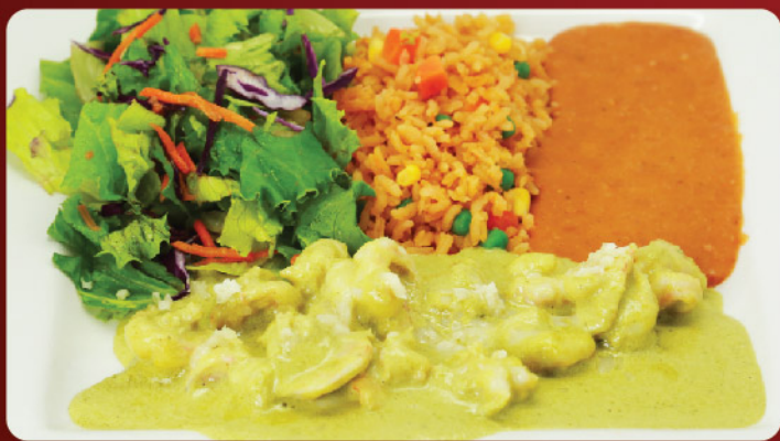
CULICHI SHRIMP 16.95