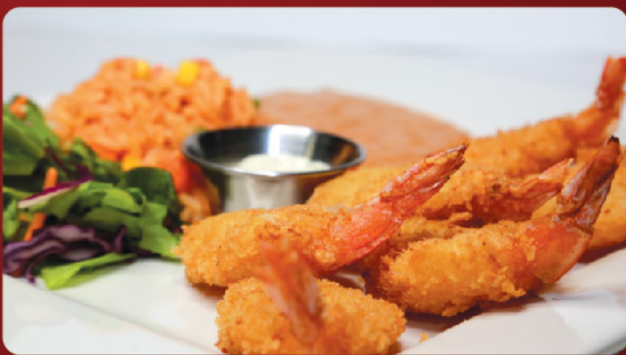
BREADED SHRIMP 16.95