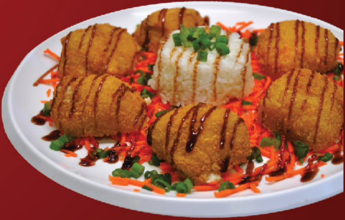
HOT CHILLIS 3 yellow hot peppers stuffed with mozzarella cheese, Philadelphia, crab mix, a side of rice and eel sauce. 7.95