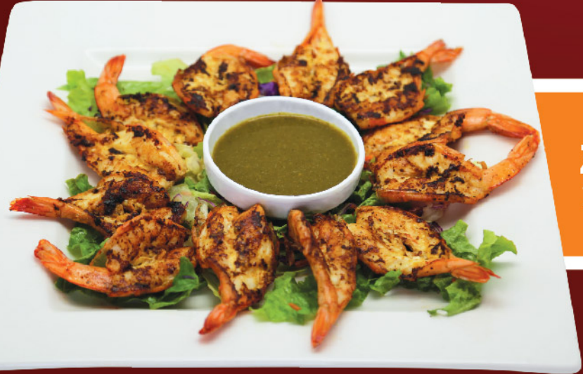
ZARANDEADO SHRIMP 18.95