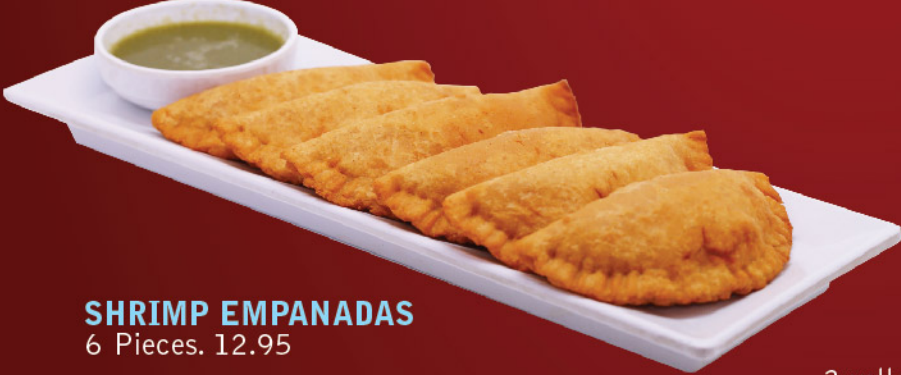
SHRIMP EMPANADAS 6 Pieces. 12.95