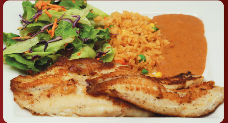
GRILLED FISH FILLET 12.95